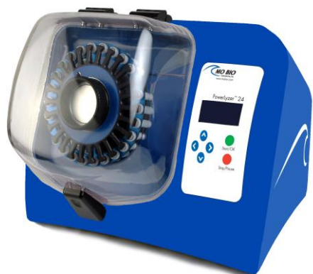
PowerLyzer ® 24 Bench Top Bead-Based Homogenizer Catalog#13155 ( www.mobio.com/powerlyzer )

The PowerLyzer ® UltraClean ® Microbial DNA Isolation Kit comes with 0.1mm Glass MicroBead Tubes for DNA extraction on high powered bead beating instruments or the vortex. Using the PowerLyzer ® 24, microbial samples are lysed in 5 minutes at 2000 RPM. The instrument's velocity and proprietary motion combine to provide the fastest homogenization time possible, minimizing the time spent processing samples. For species that are difficult to lyse, such as some fungi or spores, faster settings may be employed (up to 2800 RPM for DNA isolation). Also heating at 65°C before homogenization may be used to enhance lysis. The Glass MicroBead Tubes provided may also be used on the vortex similarly to the Garnet Bead Tubes provided in the original UltraClean ® Microbial DNA Isolation Kit (MO BIO Catalog #12224).