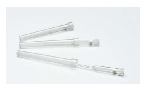
Figure 2. EZ2 Connect Fx tip racks, tip holders, and filter-tips