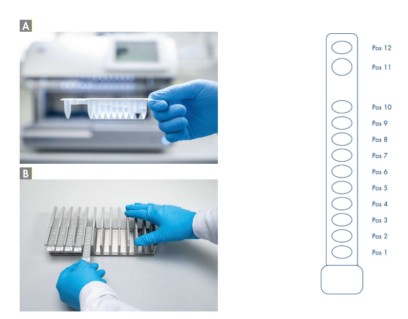
Figure 1. Ease of worktable setup using reagent cartridges. (A) A sealed, prefilled reagent cartridge. Fill levels vary, depending on the type of reagent cartridge. (B) Loading reagent cartridges into the cartridge rack. The cartridge rack itself is labeled with an arrow to indicate the direction in which reagent cartridges must be loaded.