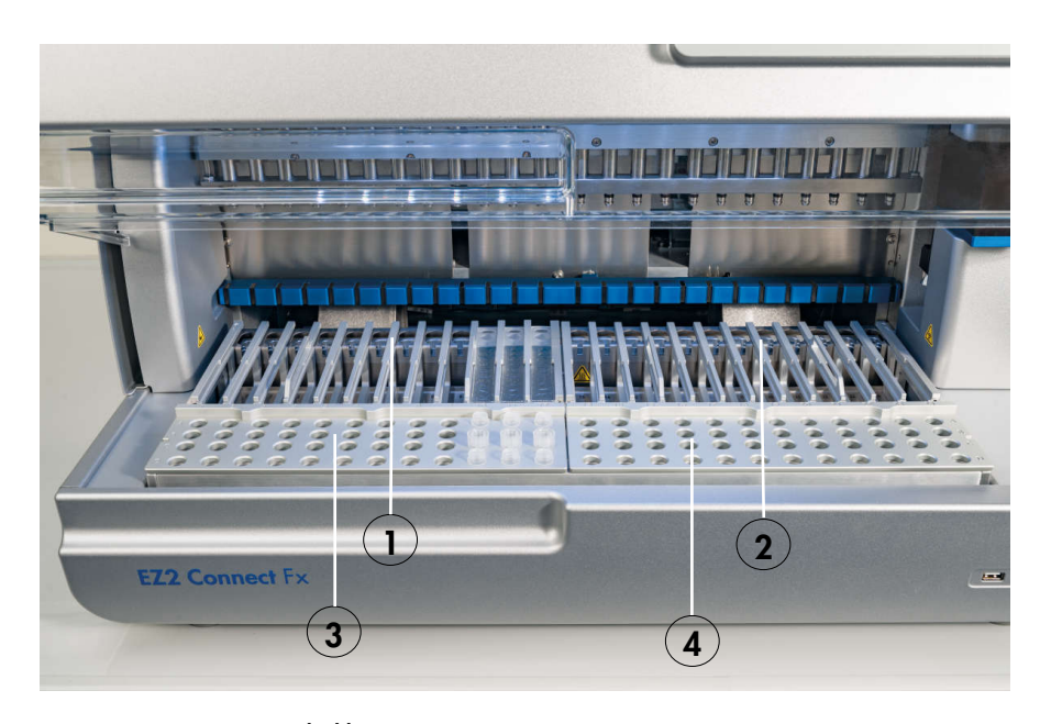
Figure 3. EZ2 Connect Fx Worktable.