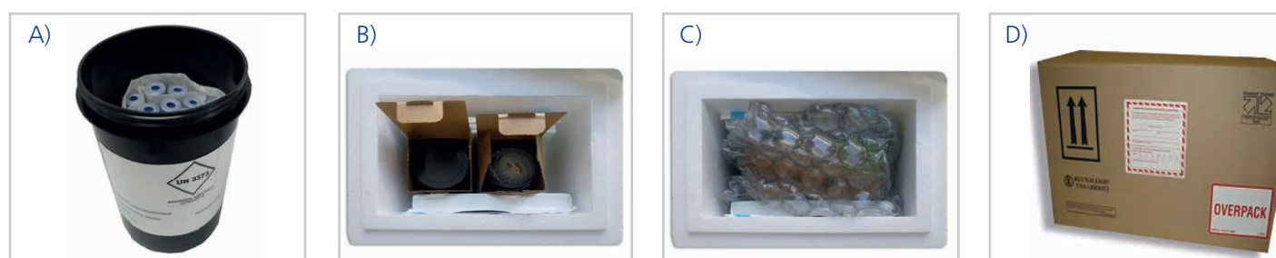
Figure 1: IATA-compliant packaging concept. Twenty (20) PAXgene Blood ccfDNA Tubes (primary receptacles) filled with blood were placed into a GBox 650 (secondary receptacle). One absorbent sheet was placed below and one on top of the tubes within the GBox. Additional absorbent sheets were wrapped around the tubes [A] . To measure the temperature profile, a datalogger was placed within the GBoxes on top of the blood tubes. Two (2) GBoxes were inserted into corrugated boxes (outer packaging) and then placed in the middle of polystyrene box. A cooling pack was placed on each side of the GBoxes [B] . Remaining space in the polystyrene box was filled with absorbent sheets and air cushion packaging foil [C] . Finally, the polystyrene box was placed into a large corrugated box (shipping box) and labelled appropriately [D] .