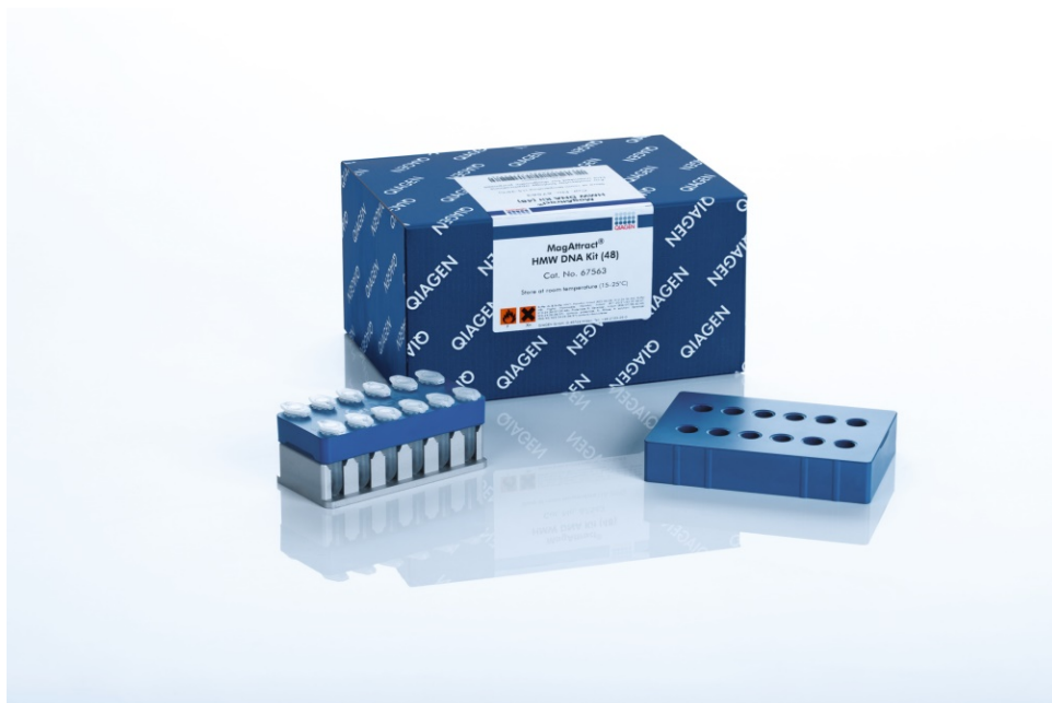
Figure 2. Convenient parallel processing of up to 12 samples with the MagAttract Magnetic Rack. The MagAttract Magnetic Rack has a removable tube holder that fits onto the Eppendorf Thermomixer or common microtiter plate mixers using the included adapter plate. The MagAttract Magnetic Rack renders unnecessary the tedious processing of individual tubes.

The MagAttract Magnetic Rack consists of 3 separate components: a tube holder, a magnetic base and an adapter plate ( Figure 2 ). The MagAttract Magnetic Rack is designed for the handling of up to 12 samples in parallel, in 2 ml reaction tubes. The magnetic-bead-based purification is performed on a standard laboratory shaker (e.g., Eppendorf Thermomixer) suited for the shaking of reaction tubes, as well as microtiter plates in SBS format. The tube holder of the MagAttract Magnetic Rack is fixed onto the shaker by the SBS adapter plate.