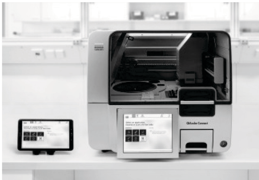
The QIAcube Connect.

QIAcube instruments are preinstalled with protocols for purification of plasmid DNA, genomic DNA, RNA, viral nucleic acids and proteins, plus DNA and RNA cleanup. The range of protocols available is continually expanding, and additional QIAGEN protocols can be downloaded free of charge at www.qiagen.com/qiacubeprotocols .