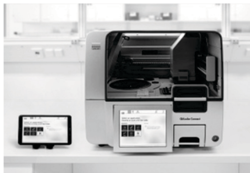
Figure 1. QIAcube Connect.

QIAcube instruments are preinstalled with protocols for purification of plasmid DNA, genomic DNA, RNA, viral nucleic acids, and proteins, plus DNA and RNA cleanup. The range of protocols available is continually expanding, and additional QIAGEN protocols can be downloaded free of charge at www.qiagen.com/qiacubeprotocols .